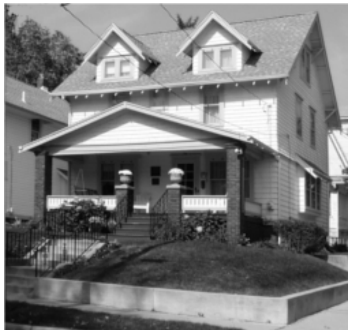
Dr. Bob's home at 855 Ardmore Avenue in Akron, Ohio, where thousands of suffering alcoholics got their first glimpse of their chance at recovery through a new way of living.

I am grateful for having the opportunity to write this.